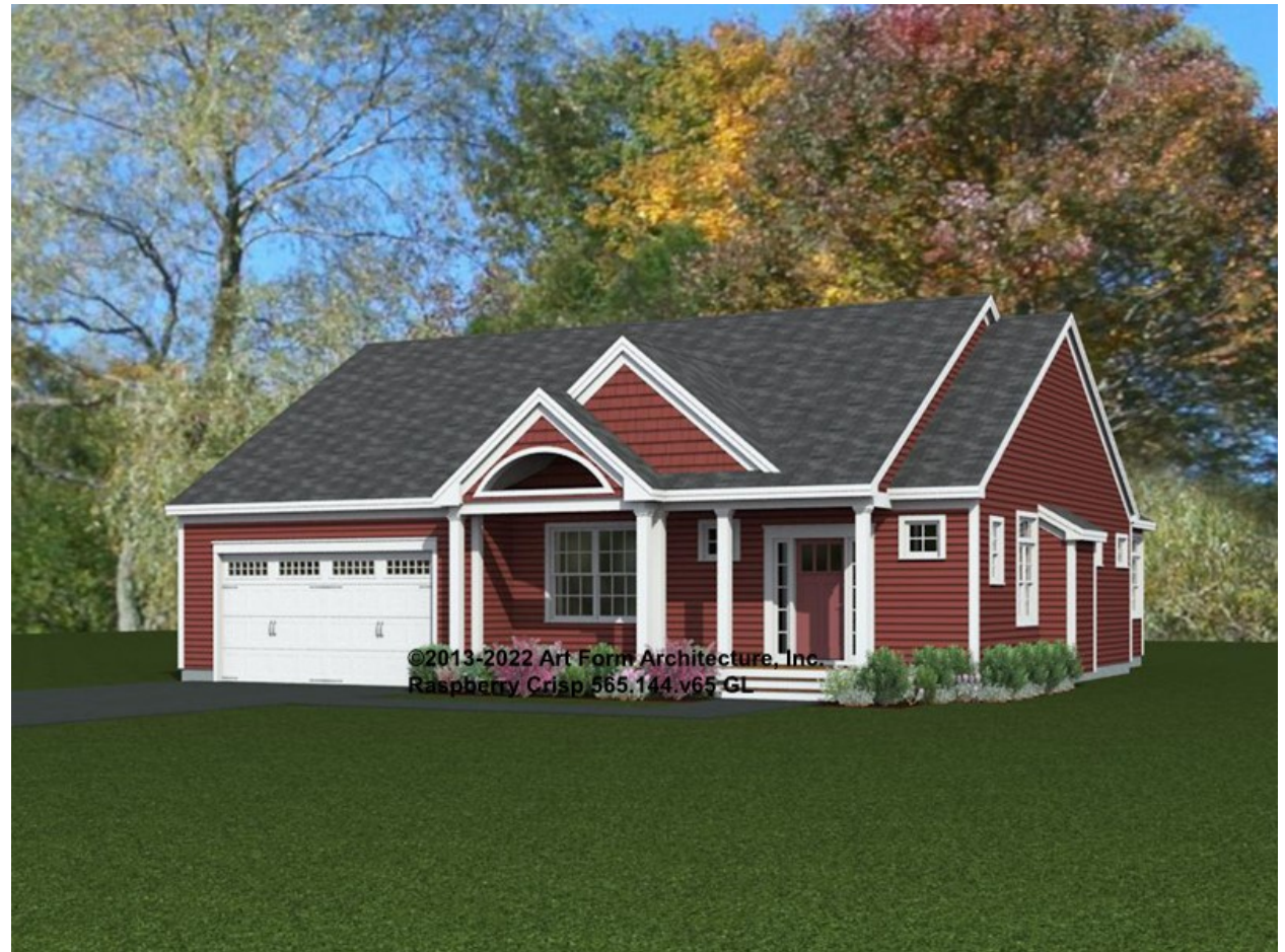
Raspberry Crisp 565.144.v65 GL

Art Form Architecture, LLC ("Artform") requires that our Drawings be built substantially as designed. Artform will not be obligated by or liable for use of this design with markups as part of any builder agreement. While we attempt to accommodate where possible and reasonable, and where the changes do not denigrate our design, any and all changes to Drawings must be approved in writing by Artform. It is recommended that you have your Drawing updated by Artform prior to attaching any Drawing to any builder agreement. Artform shall not be responsible for the misuse of or unauthorized alterations to any of its Drawings.