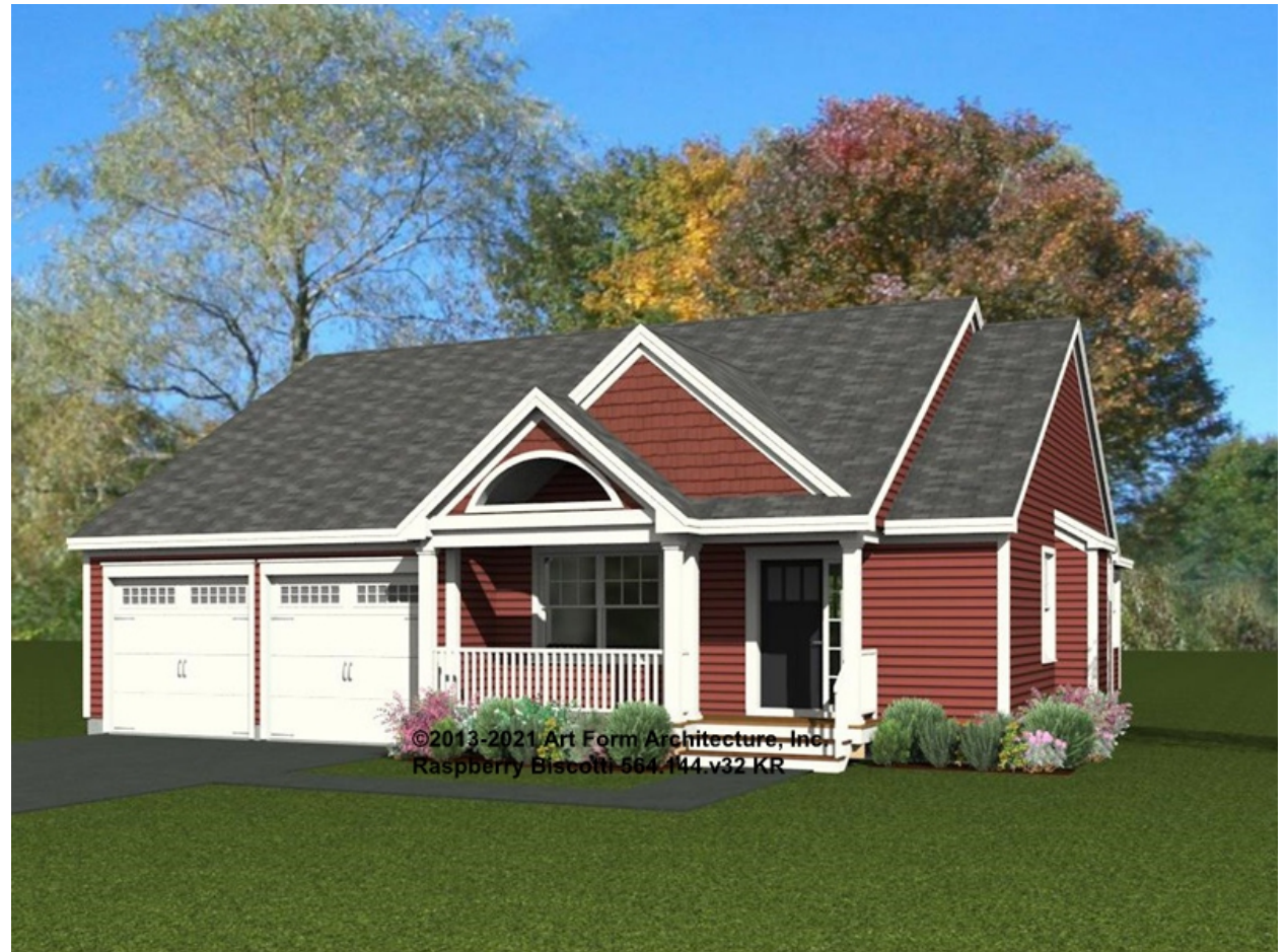
©2013-2021 Art Form Architecture, Inc. Raspberry Biscotti 564.144.v32 KR

Art Form Architecture, LLC ("Artform") requires that our Drawings be built substantially as designed. Artform will not be obligated by or liable for use of this design with markups as part of any builder agreement. While we attempt to accommodate where possible and reasonable, and where the changes do not denigrate our design, any and all changes to Drawings must be approved in writing by Artform. It is recommended that you have your Drawing updated by Artform prior to attaching any Drawing to any builder agreement. Artform shall not be responsible for the misuse of or unauthorized alterations to any of its Drawings.