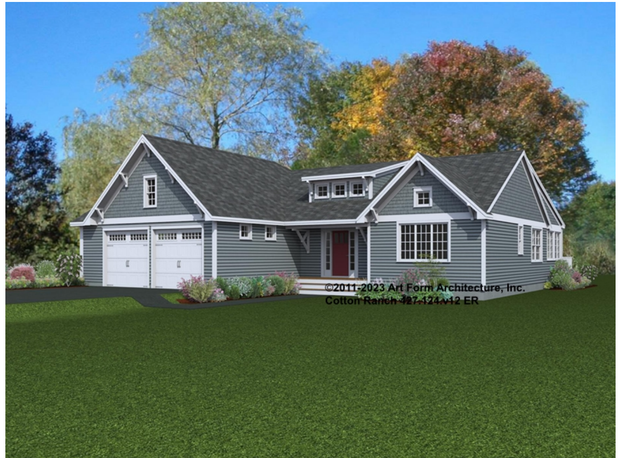
©2011-2023 Art Form Architecture, Inc. Cotton Ranch 427-124.v12 ER

Art Form Architecture, LLC ("Artform") requires that our Drawings be built substantially as designed. Artform will not be obligated by or liable for use of this design with markups as part of any builder agreement. While we attempt to accommodate where possible and reasonable, and where the changes do not denigrate our design, any and all changes to Drawings must be approved in writing by Artform. It is recommended that you have your Drawing updated by Artform prior to attaching any Drawing to any builder agreement. Artform shall not be responsible for the misuse of or unauthorized alterations to any of its Drawings.