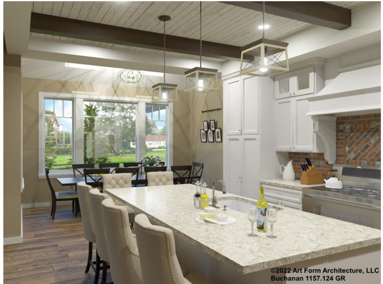
Interior View - Kitchen & Dining - Additional Image

Some features shown are optional. Your Purchase & Sale Agreement governs, whether items are labeled "optional" in this document or not.