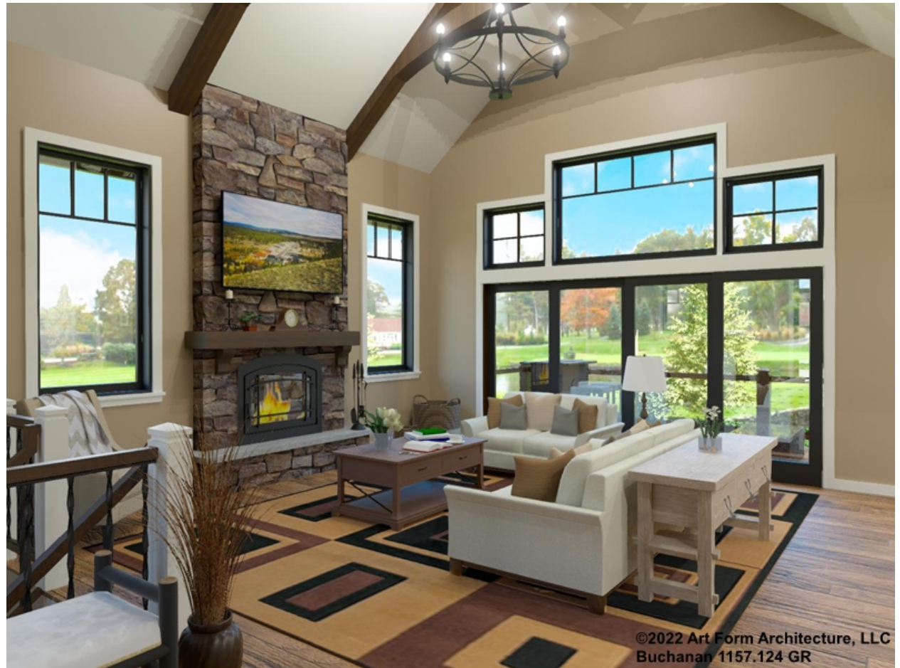
Interior View - Great Room - Additional Image

Some features shown are optional. Your Purchase & Sale Agreement governs, whether items are labeled "optional" in this document or not.