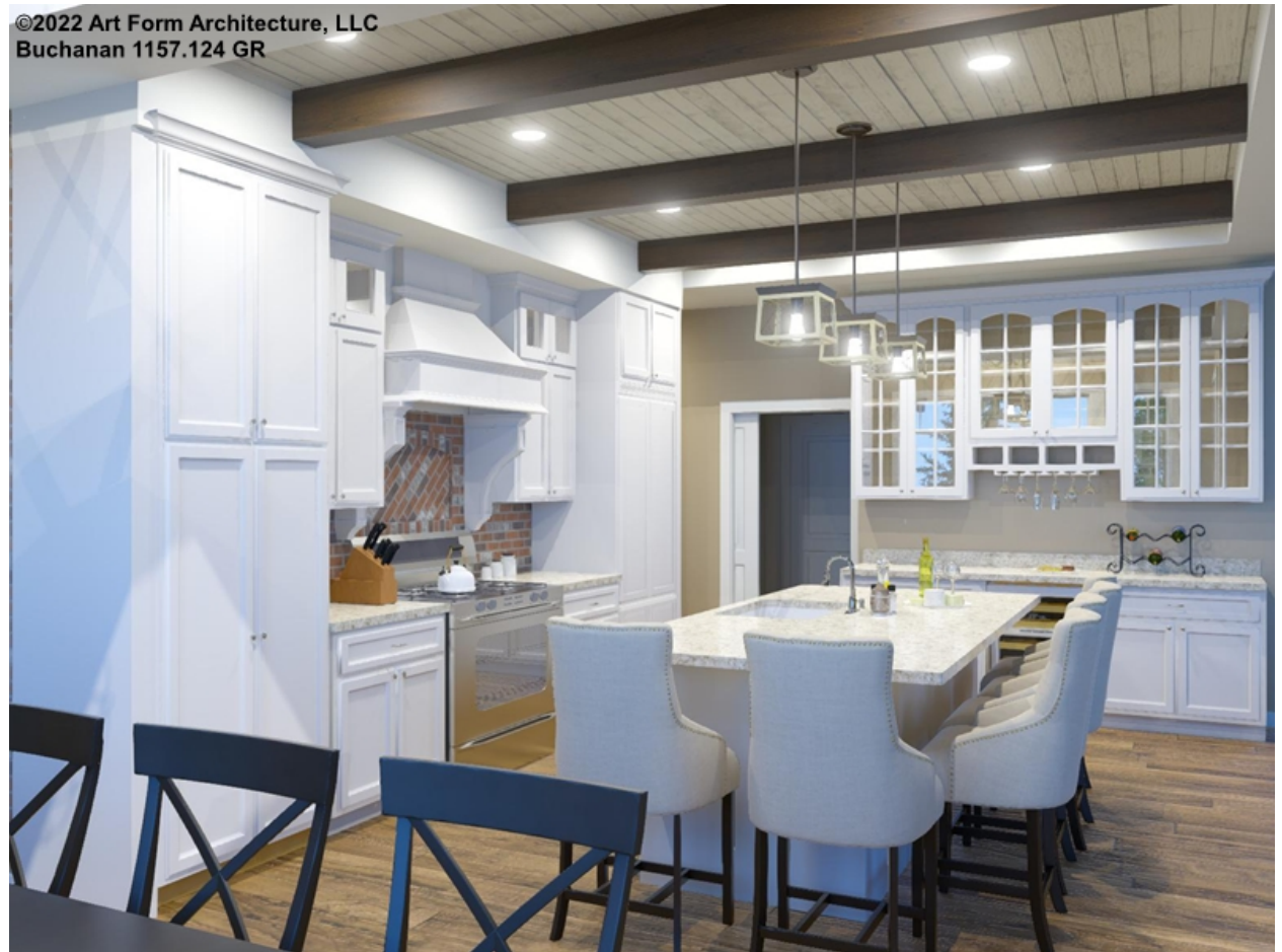
Interior View - Kitchen - Additional Image

Some features shown are optional. Your Purchase & Sale Agreement governs, whether items are labeled "optional" in this document or not.