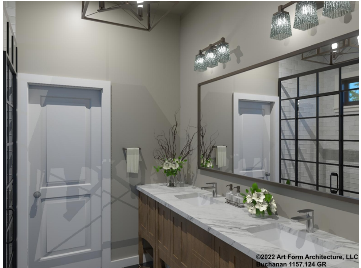
Interior View - Primary Bath - Additional Image

Some features shown are optional. Your Purchase & Sale Agreement governs, whether items are labeled "optional" in this document or not.