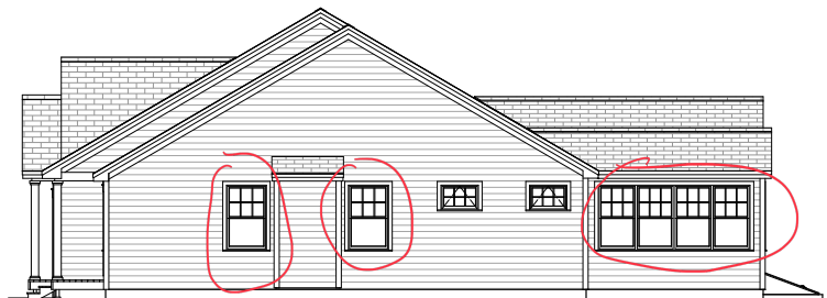
Right Elevation Scale: 1/8" = 1'-0"