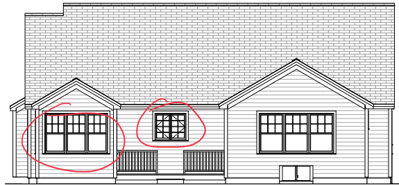
Rear Elevation Scale: 1/8" = 1'-0"