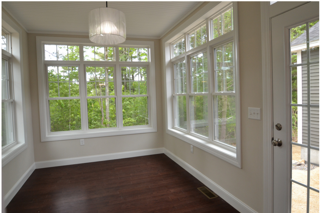
Fig. 3 Double hung windows in sunroom with transoms above