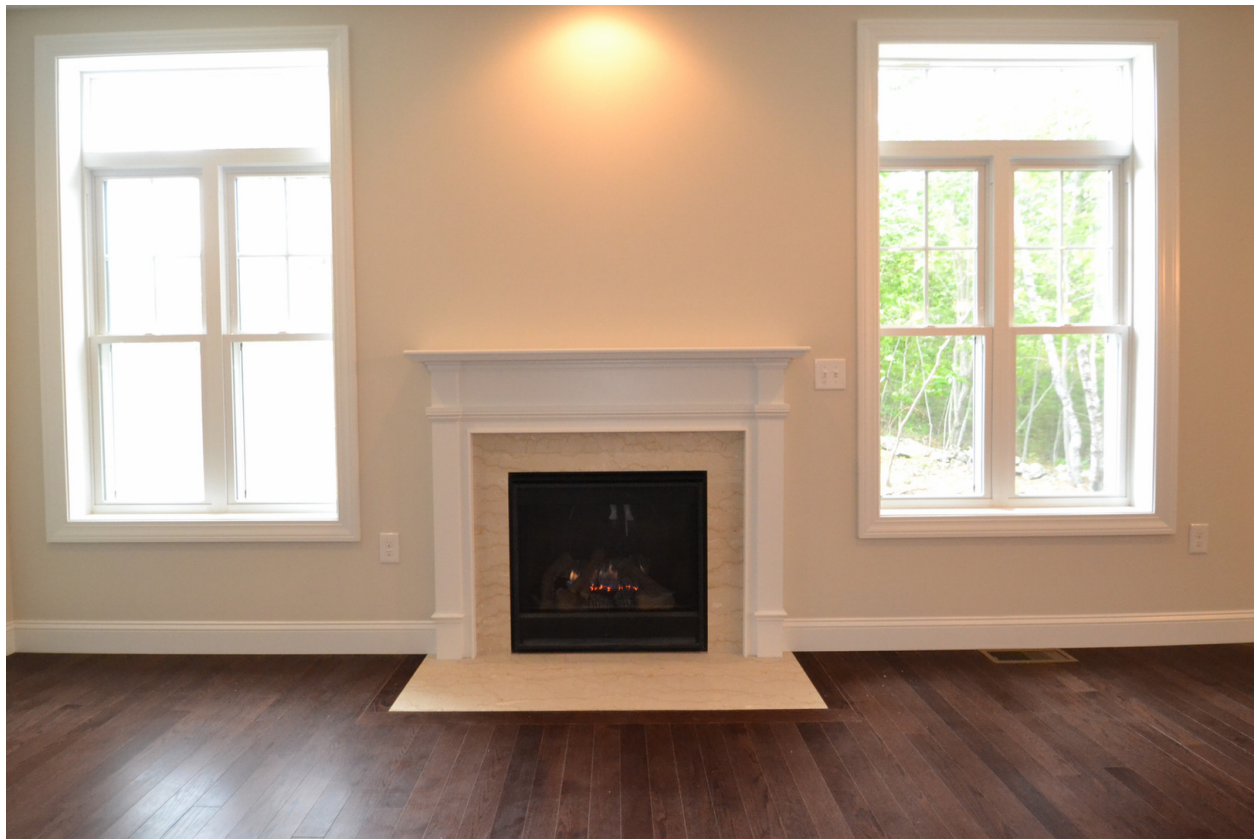
Fig. 2 Double hung windows in living room with transoms above