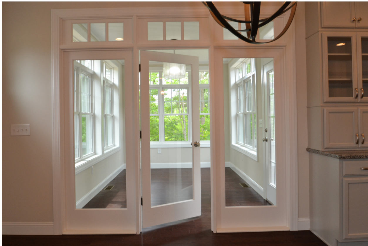
Fig. 4 Sunroom entrance with transoms above