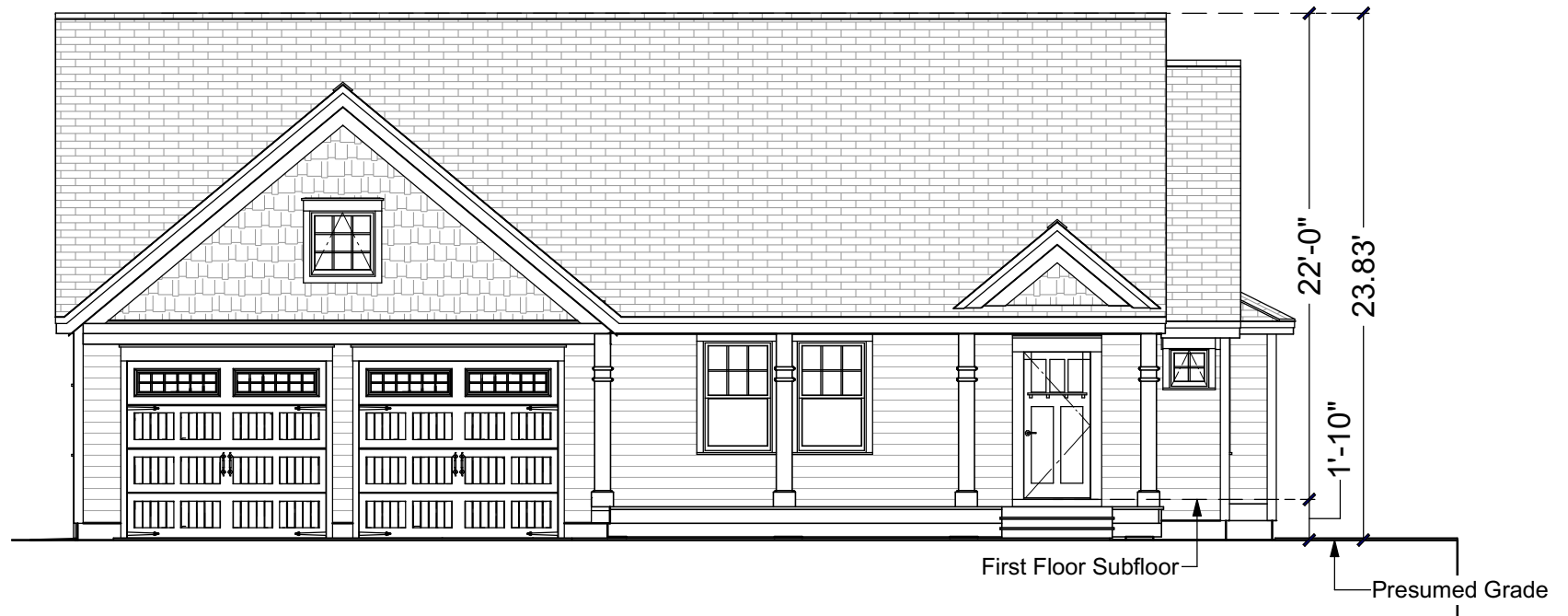
Front Elevation Scale: 1/8" = 1'-0"