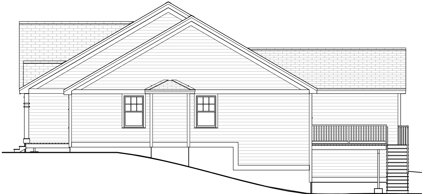
Right Elevation Scale: 1/8" = 1'-0"